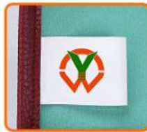
WASHING CARE LABEL