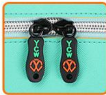
RUBBER ZIPPER PULLER