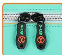
RUBBER ZIPPER PULLER