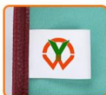
WASHING CARE LABEL