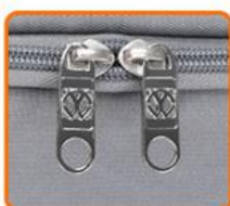
METAL DEBOSSED ZIPPER PULLER