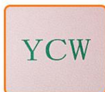
SILK SCREEN PRINTING