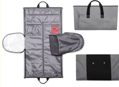
Various folding ways of bags make travel more convenient and quick